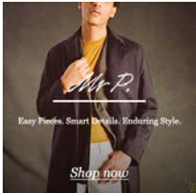
( http://prf.hn/click/camref:1100 )