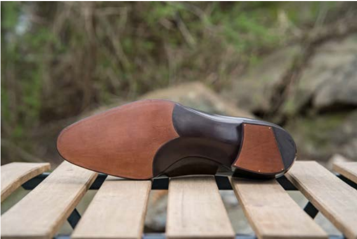
( https://i.wp.com/shoegazing.com/wp-content/uploads/2021/05/DSC04331-scaled.jpg?ssl=1 )

You can basically choose any model in any leather on any last from Gaziano & Girling's extensive stable of offerings, small modifications of patterns are possible, like removing a medallion or similar, and you can also do small add-ons to the lasts for improved fitting, like built up the instep more or add at the inner ball of the foot or similar. You also choose specs like type of sole, straight or tapered heels etc. The shoes will then be made by the in-house bespoke department which houses on the top floor of their factory in Kettering, Northampton, to exactly the same standard as their bespoke shoes, with hinged lasted shoe trees included. Delivery time is approximately four months. The price is hefty – €3,850 (£3,300) including VAT for shoes, and €4,200 (£3,600) for boots – but I'd say it's quite understandable.