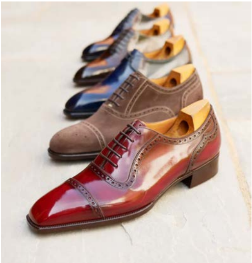
( https://i2.wp.com/shoegazing.com/wp-content/uploads/2021/05/Optimum-collection-kopia-scaled.jpg?ssl=1 )

Finish off with some of G&G's photos of other Optimum range samples.