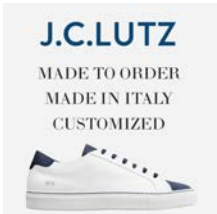
( https://www.jclutz.com/ )