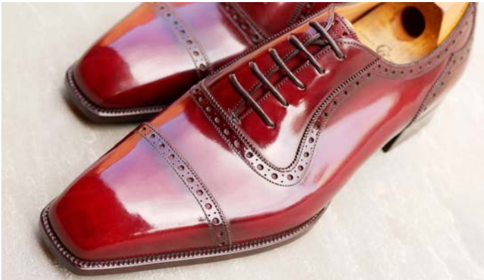
( https://i2.wp.com/shoegazing.com/wp-content/uploads/2021/05/St-James-2-Optimum-5-kopia-scaled.jpg?ssl=1 )

Of course they had to make a version of the St. James II in Vintage Cherry.