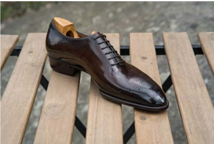
( https://i.wp.com/shoegazing.com/wp-content/uploads/2021/05/DSC04322-scaled.jpg?ssl=1 )

You can basically choose any model in any leather on any last from Gaziano & Girling's extensive stable of offerings, small modifications of patterns are possible, like removing a medallion or similar, and you can also do small add-ons to the lasts for improved fitting, like built up the instep more or add at the inner ball of the foot or similar. You also choose specs like type of sole, straight or tapered heels etc. The shoes will then be made by the in-house bespoke department which houses on the top floor of their factory in Kettering, Northampton, to exactly the same standard as their bespoke shoes, with hinged lasted shoe trees included. Delivery time is approximately four months. The price is hefty – €3,850 (£3,300) including VAT for shoes, and €4,200 (£3,600) for boots – but I'd say it's quite understandable.