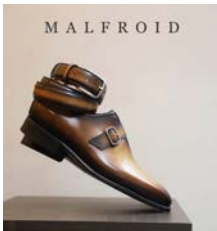
( https://malfroid.com/en/ )