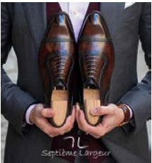
( https://www.septiemelargeur.fr )

One of the first samples of the Optimum range. The model Grant in Vintage Oak, on the DG70 last, made to bespoke standards.