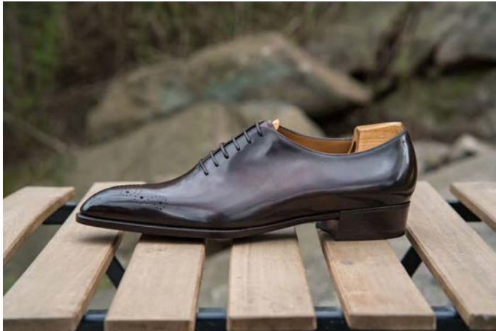
https://i0.wp.com/shoegazing.com/wp-content/uploads/2021/05/DSC04324-scaled.jpg?ssl=1 Posture like a race car.

For those who really like Gaziano & Girling and find their lasts to fit good, and at the same time want to step up the game to the absolute top level of shoes, the Optimum range sure is a nice addition. Also for those who never would be able to visit England or one of their trunk shows for full bespoke, but want to get as close to that as possible with a remote order, can have their wish fulfilled now.