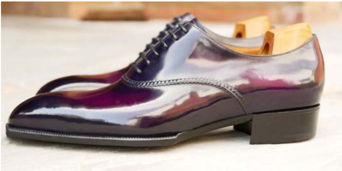
( https://i1.wp.com/shoegazing.com/wp-content/uploads/2021/05/Wren-Optimum-8-kopia-scaled.jpg?ssl=1 )

Finish off with some of G&G's photos of other Optimum range samples.