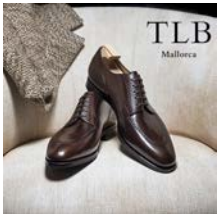
( https://www.tlbmallorca.com/ )