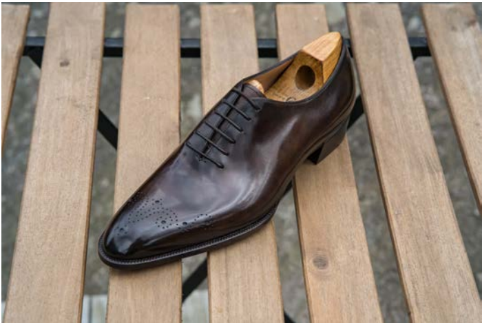
( https://i2.wp.com/shoegazing.com/wp-content/uploads/2021/05/DSC04317-scaled.jpg?ssl=1 )

When Gaziano & Girling ( http://gazanogirling.com/ ) was launched in 2006 by Tony Gaziano and Dean Girling, they introduced a bunch of features that one hadn't really seen, at least in a long time, on factory-made Goodyear welted shoes, and their premium segment footwear looked more like how bespoke shoes looked than what one was used to for factory-made shoes. Then a few years later they presented the Deco range, available as MTO, which was another step up in terms of sleekness, slim waists, construction details etc. Now they've gone the whole way. With Optimum Range, you basically can't get further in terms of material and make. G&G's bespoke has a reputation as among the best bespoke shoes you can get, and now this level is made available as Made to Order on the brands regular standard lasts.