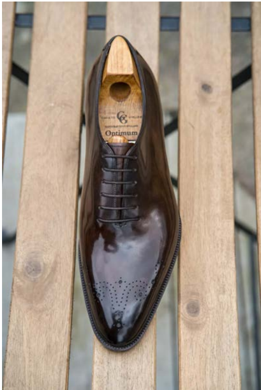
https://i0.wp.com/shoegazing.com/wp-content/uploads/2021/05/DSC04376-scaled.jpg?ssl=1 Top view.

For those who really like Gaziano & Girling and find their lasts to fit good, and at the same time want to step up the game to the absolute top level of shoes, the Optimum range sure is a nice addition. Also for those who never would be able to visit England or one of their trunk shows for full bespoke, but want to get as close to that as possible with a remote order, can have their wish fulfilled now.