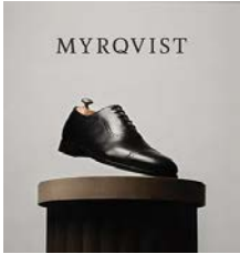
( https://myrqvist.se/ )