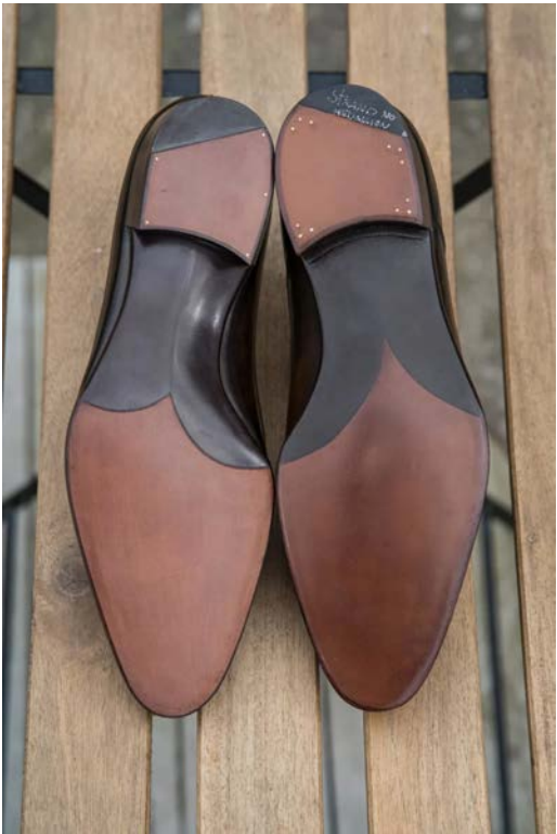
( https://i0.wp.com/shoegazing.com/wp-content/uploads/2021/05/DSC04416-scaled.jpg?ssl=1 )

Soles. Now Optimum to the left, RTW main line to the right.