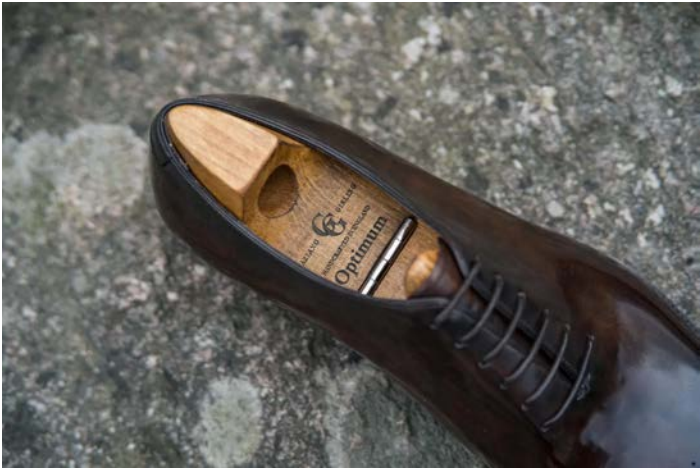
( https://i2.wp.com/shoegazing.com/wp-content/uploads/2021/05/DSC04423-scaled.jpg?ssl=1 )

Soles. Now Optimum to the left, RTW main line to the right.