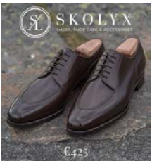
( https://www.skolyx.se/en/?utm_source=Shoegazingen )